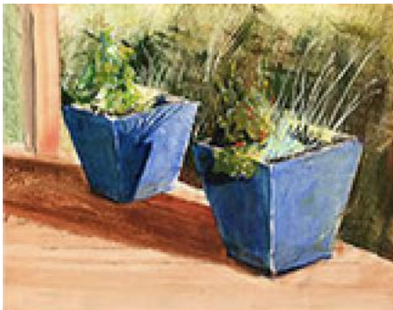
Two Blues Twin vases with grass and ferns Acrylic