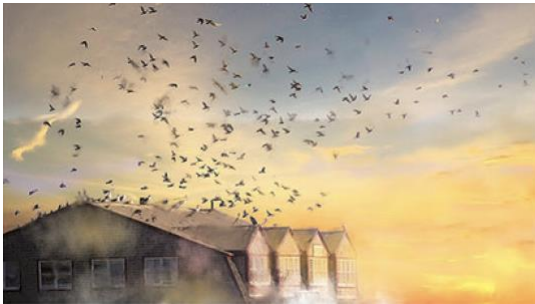
Flight at Sunset Euphoric rising of the birds at twilight Watercolor

Please email artist directly at Garrow@GTvisual.com for artwork inquires or purchases. For the full collection please visit www.gtvisual.com