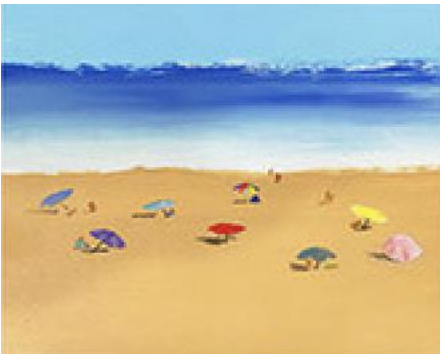
Umbrella Party Colored canopies sprinkled in the sand Acrylic