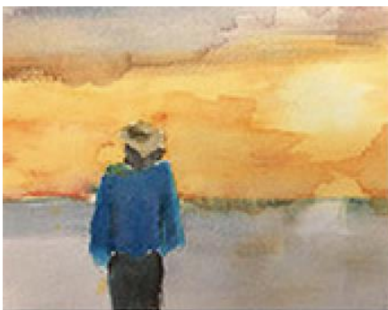
Evening Sky The sun lays low in a bath of color Watercolor