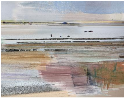
Oyster Farmers Combing the flats in search of treasure Acrylic