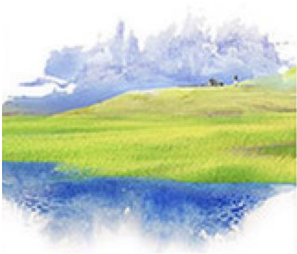
Marsh Grass Lime green carpet against the deep blue water Watercolor