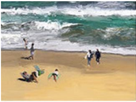
Ocean Walk Sharing the blue green water together Acrylic