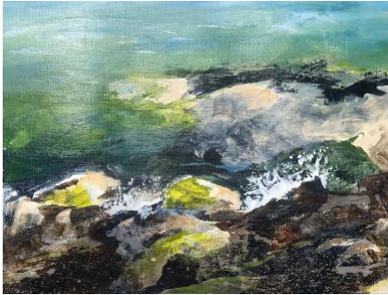
On the Rocks The paint is still drying but I want to jump in Acrylic