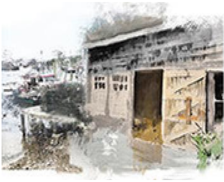
Menemsha Aging boathouse on the harbor Watercolor