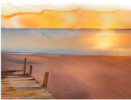
Dock on the Bay Low tide on a becalmed day Acrylic