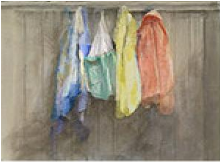
Hanging Out Evidence of a day well spent Watercolor