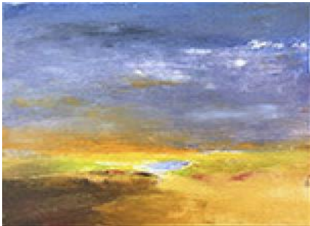
Stormy Sunset Blue inlet glowing in the turbulent sky Oil