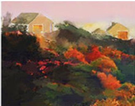
Brilliant Sunset Sun kissed foliage at the end of the day Acrylic