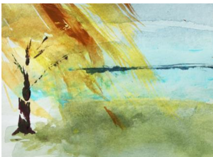
Weeping Willow I can feel the breeze Watercolor