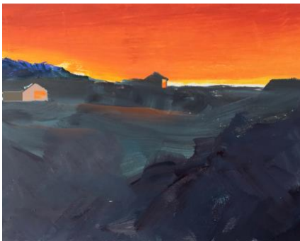
Winter Sunset Darkness comes quickly with winter Acrylic