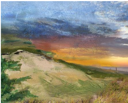
Sunset, Head of the Meadow Another summer sundown Acrylic