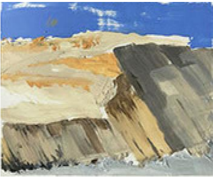
Ballston Cliffs Standing high against The changing winds Acrylic