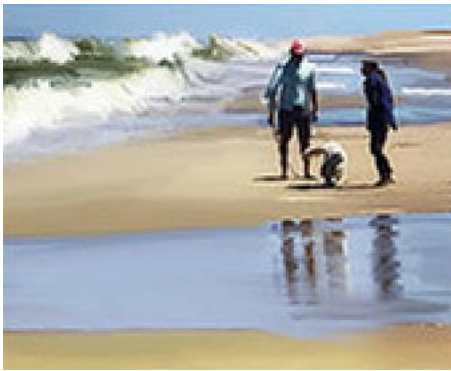
Beach Dog A loyal companion sharing the ocean's edge Acrylic