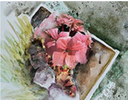
Deconstructed Petunias Spring forth on a summer day Acrylic