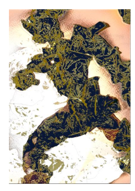
Wallpaper #9 Photographic Illustration 2021