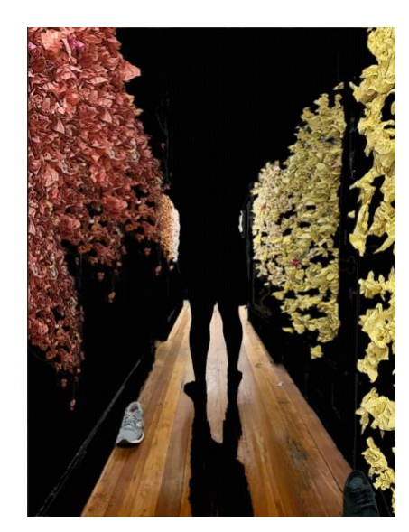
Wallpaper #2 Photographic Illustration 2021