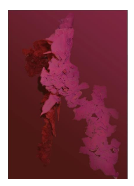
Wallpaper #4 Photographic Illustration 2021