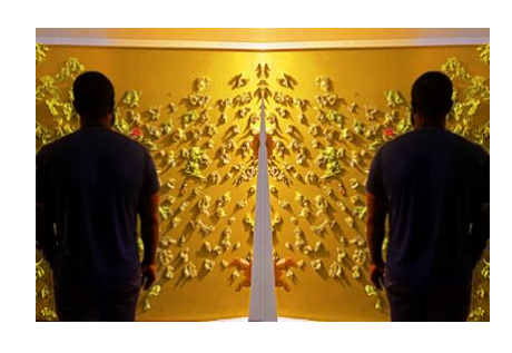
Wallpaper #5 Photographic Illustration 2021