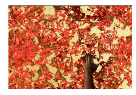
Wallpaper #10 Photographic Illustration 2021