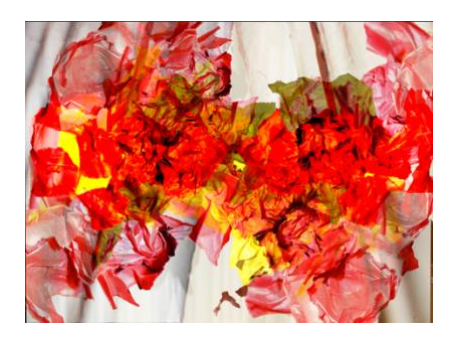
Wallpaper #7 Photographic Illustration 2021