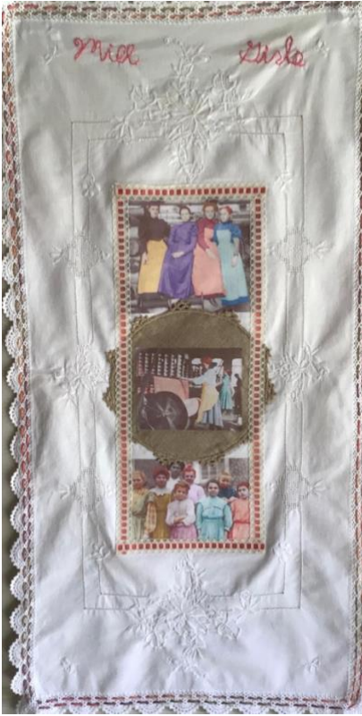
Mill Girls Textile