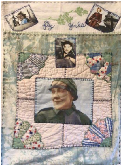
Fly Girls Textile