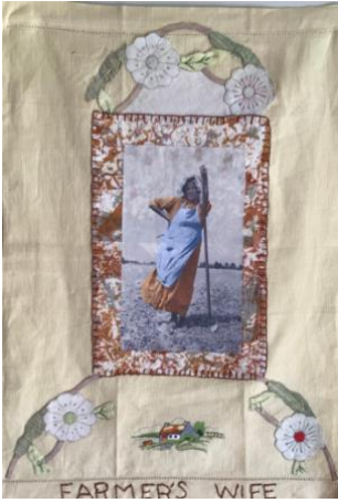
Farmer's Wife Textile