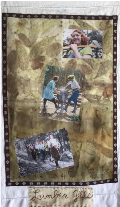
Lumber Jills Textile