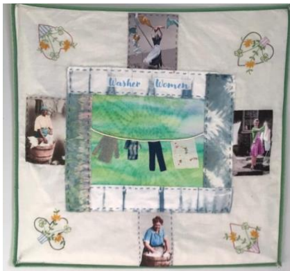
Washer Women Textile