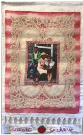
Tomato Pickers Textile