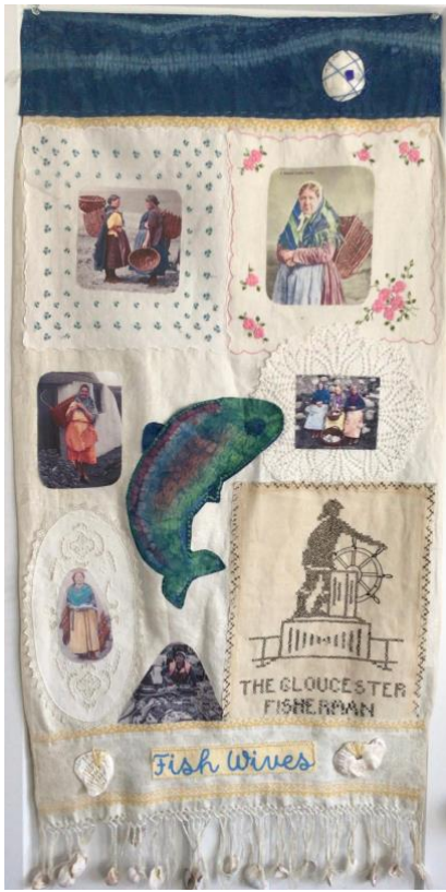
Fish Wives Textile