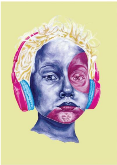
“Tune Out & Tune Up”