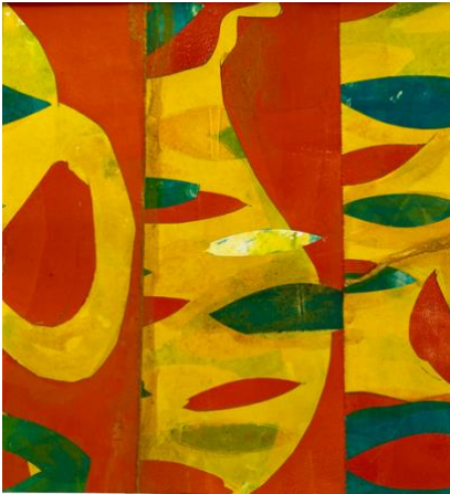
“Birds of a Feather”