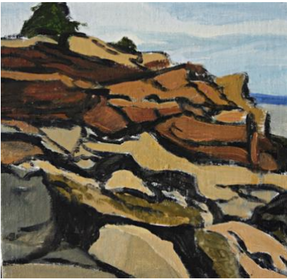
"Coast Study #3"