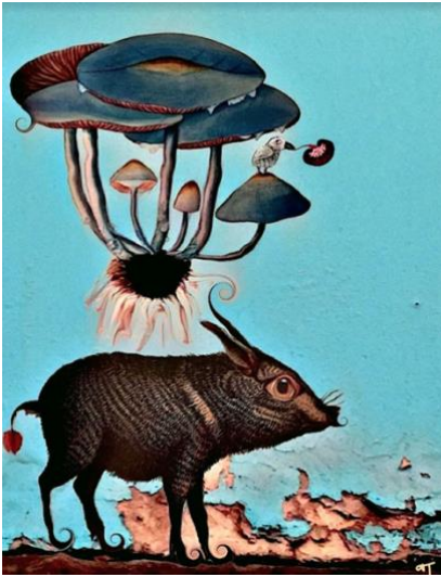
"Ickmay found a kidney for Porge, but will it fit?" 8.5" x 11"