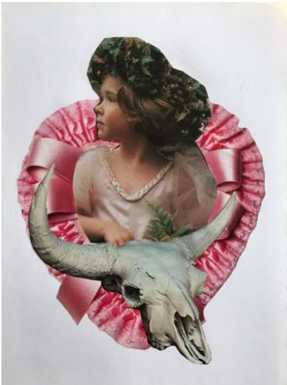
"Birth of a Daughter"