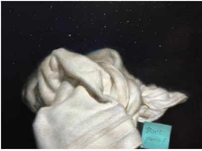
“Always Carry a Towel”