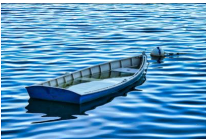
"Awaiting the Voyage"