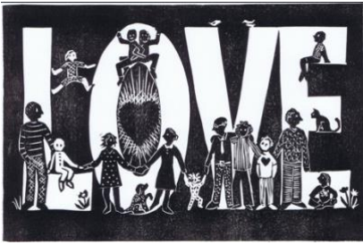
"All in This Together"