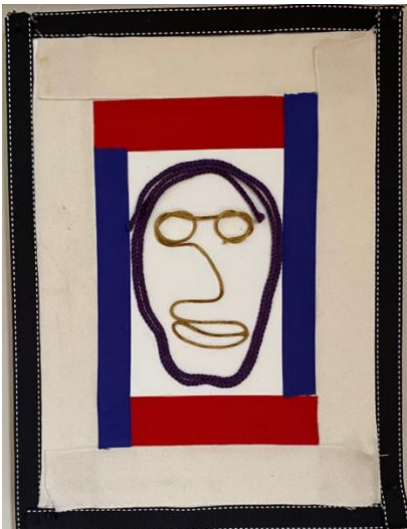
"Two String Face"