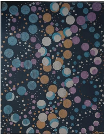
“Circles on Midnight Blue”