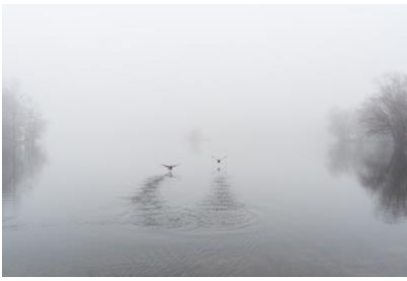
Foggy Morning Ripples Archival Pigment Print