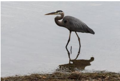
Heron Dance Archival Pigment Print