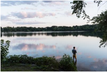
Ravishing Reel Archival Pigment Print