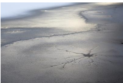
Starburst Archival Pigment Print