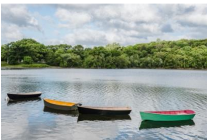
Rowboats Archival Pigment Print