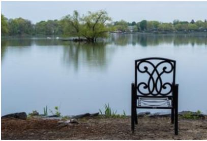
Contemplation Archival Pigment Print