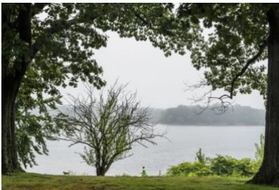
Best Friends Archival Pigment Print

Please email artist directly for artwork inquires or purchases. www.dawncolsia.com or dawncolsia@gmail.com