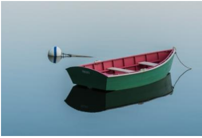
Tranquility Archival Pigment Print