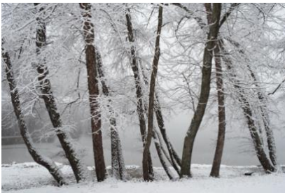
Winter Paradise Archival Pigment Print