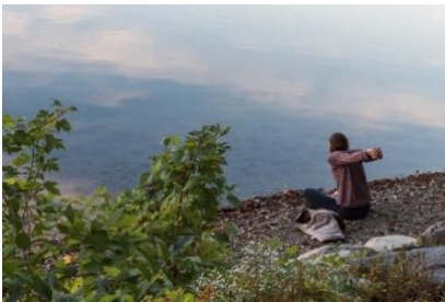
Morning Stretch Archival Pigment Print