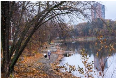
Afternoon Walk Archival Pigment Print