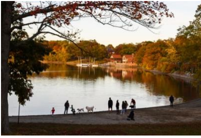
Evening Gathering Archival Pigment Print