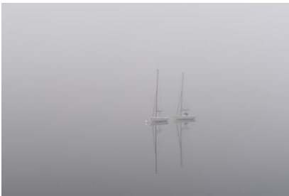
Resting Archival Pigment Print