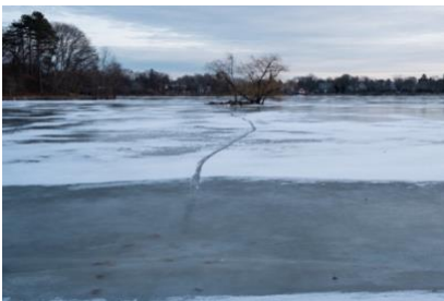
Island Adventure Archival Pigment Print