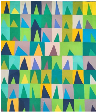
"North Haverhill Mountains" Fabric