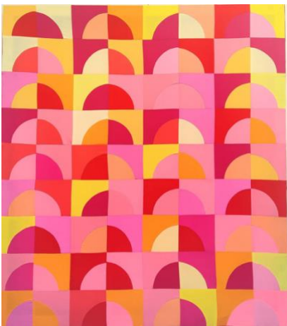
"Tropical Sunrise" Fabric