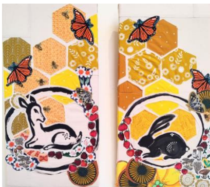
"Fawn & Rabbit" Fabric