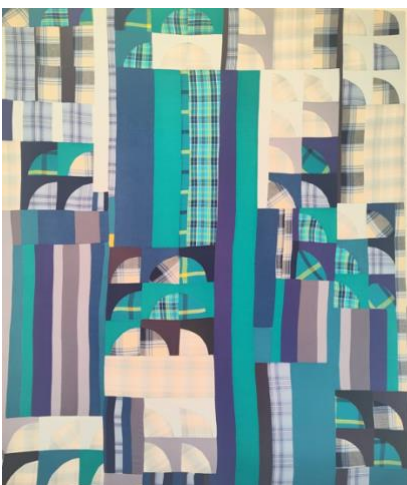
"Diana's Baths" Fabric