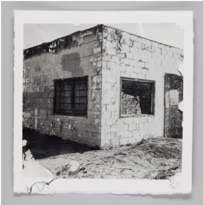
Store Front, Grover Beach, CA Alcohol Transfer 2019