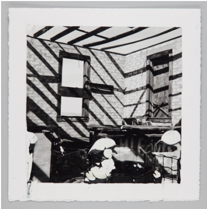
Tire Shop, Ludlow, CA Alcohol Transfer 2019