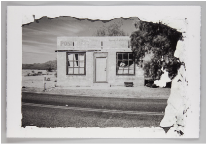
Post, Kelso, CA Alcohol Transfer 2017