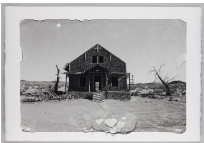
Stand Alone, Ludlow, CA Alcohol Transfer 2017