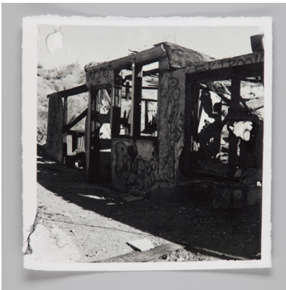
Back Yard, Jawbone Canyon, CA Alcohol Transfer 2019