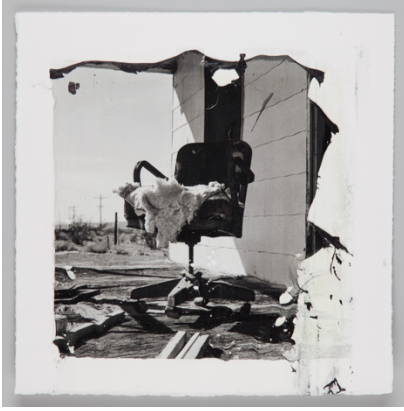
Office Chair, Ludlow, CA Alcohol Transfer 2019