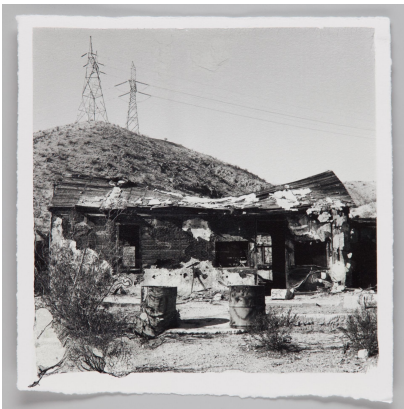
Home, Jawbone Canyon, CA Alcohol Transfer 2019