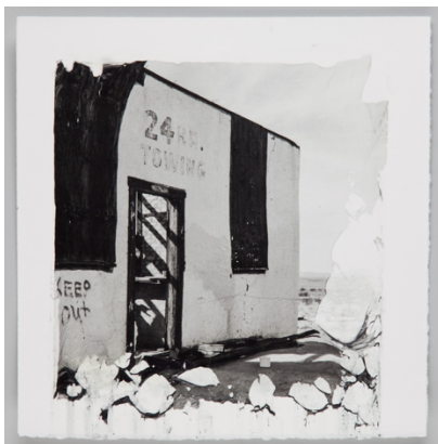
24 Hour Towing, Ludlow, CA Alcohol Transfer 2019