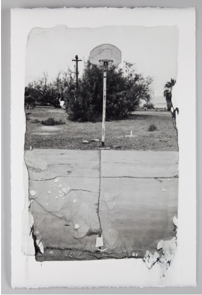
Hoop, Zzyzx, CA Alcohol Transfer 2019